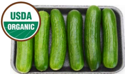
ORGANIC MINI CUCUMBERS CANADA GROWN • 6 PK

We're working hard to restock as quickly as possible and appreciate your patience and understanding.