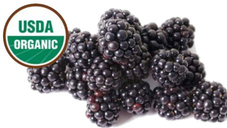
ORGANIC BLACKBERRIES CALIFORNIA GROWN • 6 OZ