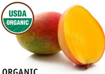
ORGANIC KENT MANGOES MEXICO GROWN