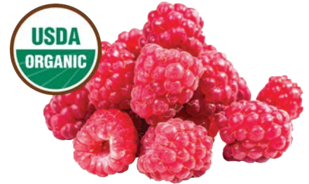
ORGANIC RASPBERRIES MEXICO GROWN • 6 OZ