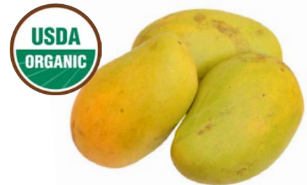
ORGANIC ATAULFO MANGOES MEXICO GROWN